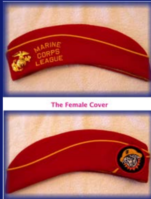
The Female Cover