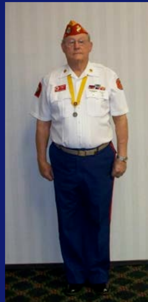
Blue Trousers with Red NCO Stripe